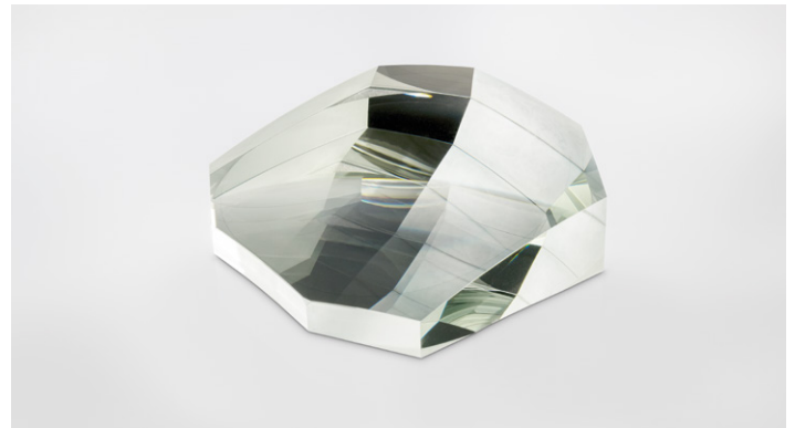
Prism for EnMAP project*.