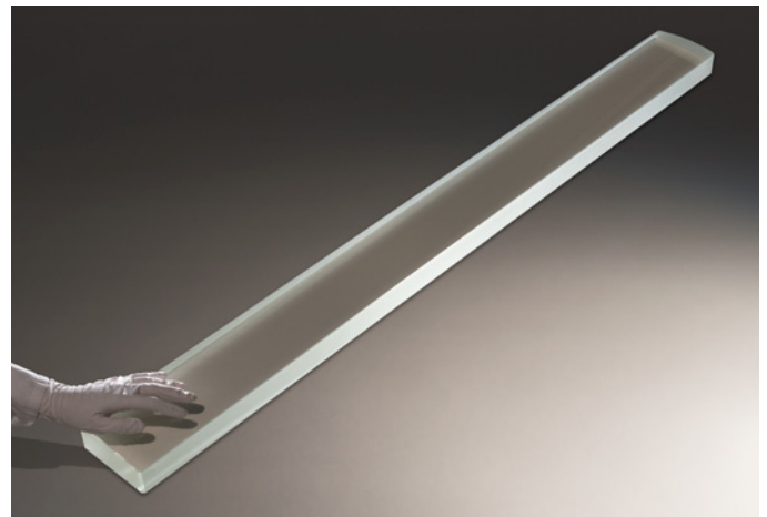
Large cylindrical lens (up to 2,000mm, cylindrical and plane) for laser annealing and laser lift-off

We have developed an innovative measurement process for large-size plane and cylindrical lenses and employ the stitching method, among others.